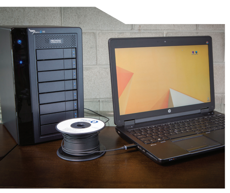
HP Z* Workstations with Thunderbolt™ 2 are a great option for 4K productions and come in a variety of form factors including mobile, all-in-one, and tower workstations.